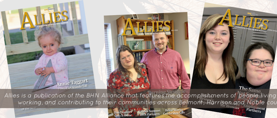
Allies is a publication of the BHN Alliance that features the accomplishments of people living, learning, working, and contributing to their communities across Belmont, Harrison and Noble counties.

A dedicated team of SSAs took a compassionate approach in the design of our improved Individual Support Plan (ISP) in 2017. It is now a document that more accurately reflects each person we support and we are proud to report that several county boards across our region have adopted it as their own.